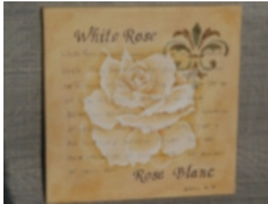
[See photo attachment to Newsletter]